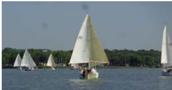
Lake Worth Sailing Club hosted Catalina 22 Regional Regatta on Memorial Day weekend. Weather and racing were hot. Results and list of volunteers should be posted on new website.