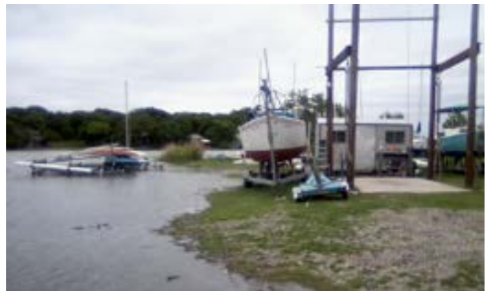
High water at club, May 9, 2019, best check your docklines!

The club has available for checkout, a crimping tool and sleeves, a bosun's chair and a tension gauge. Contact the Commodore for these items.